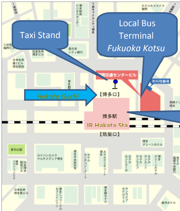
Local Bus Terminal Fukuoka Kotsu Center